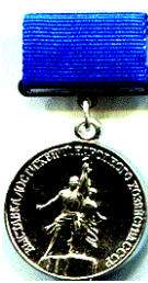
Medal VDNH Ukrainian SSR