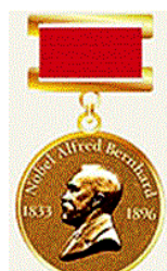
Medal Alfred Nobel