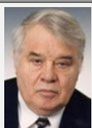
POTAPOV A.I. - Corresponding Member Academy of Medical Sciences of the USSR, Doctor of Medical Sciences, Professor. Minister of the Ministry of Health of the RSFSR. Feedback on the effectiveness of the rehabilitation direction "Bioactivation without the use of external current sources" in the elimination of the consequences of the explosion of a product pipeline in the BASSR (No 086/105 dated 04.16.86, * 025657)

Devices of the VITA-01M type, operating without the use of external power sources and the author's means of "bioactivation" (V.G. Makats, V.I. Nagaychuk, Ukraine) were