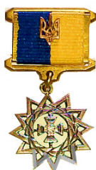
The order Harmony of life