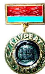
Laureate of the Central Committee of the LKSMU Prize