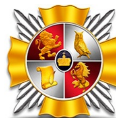
The order Primus inter pares