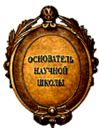
Founder of a scientific school (RF)