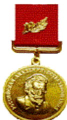
Medal Academician V. Vernadsky