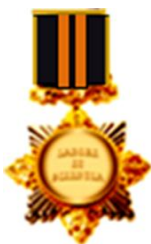
The order Labore et scientia