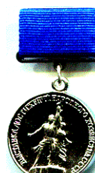
Medal USSR VDNH